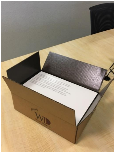
Interior Color, Logo & Paper Topper: