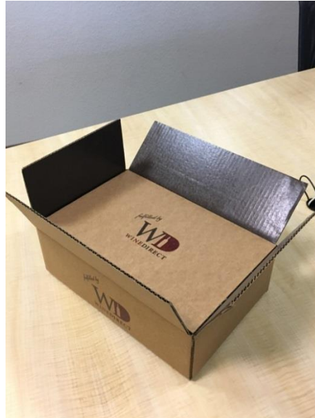
Interior Color, Logo & Cardboard Topper: