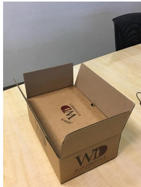
Logo & Cardboard Topper: